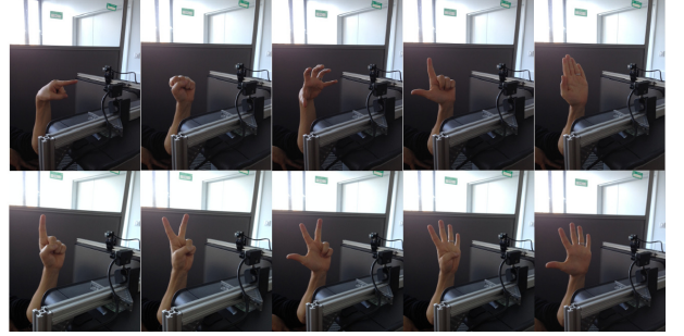
Fig. 2: The hand pose database

In its nature a support vector machine (SVM) is a binary classifier, yet there exist several methods to extend it for multi-class problems (e.g. one-versus-all or one-vs-one). In our experiments we chose to use the one-vs-one ([18]) approach in combination with crossvalidation. The method can be roughly described as follows; let N be the number of classes, x \in \mathbb{R}^k a feature vector and k_p : \mathbb{R} \times \mathbb{R} \rightarrow \mathbb{R} an arbitrary kernel parametrized by a set p . In one-versus-one the amount of SVMs to be trained is N(N-1)/2 =: P , i.e. one trains an SVM for each possible two-class combination. Formally stated, if \tilde{x}_{i,\gamma,\delta} represents the i -th support vector (SV) for classes \gamma, \delta , \tilde{\alpha}_{i,\gamma,\delta} the corresponding coefficient and b_{\gamma,\delta} the