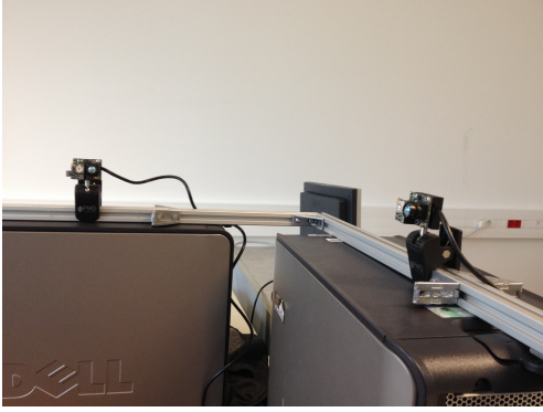
Fig. 1: The current setup for 90°

necessarily wish for every classification to be taken seriously, and we define several confidence measures \text{conf}(\{o_i\}) to this effect. Final decisions are thus taken in the following way: